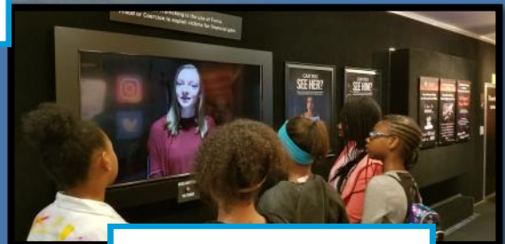
Lake City Community Center

NATIONAL HUMAN TRAFFICKING HOTLINE 1-888-373-7878