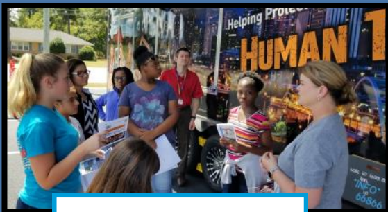
Lake City Community Center