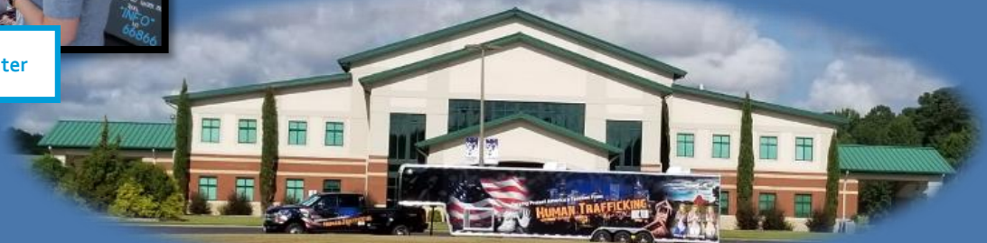
Cornerstone Baptist Church